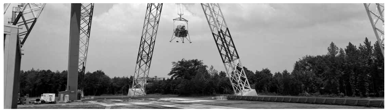
<u>LRC-1965-B701_P-04813</u>: Lunar Landing Research Facility (LLRF) in operation - The Lunar Landing Research Facility at Langley Research Center has been put into operation.